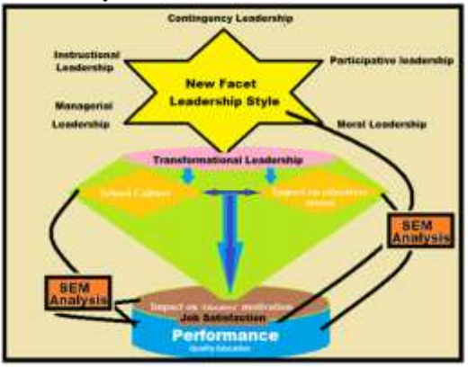
Figure 1 New Facet Leadership Style and Job Satisfaction Conceptual Framework for the Mauritian Education System (Subrun & Subrun, 2022)

The conceptual framework steering the qualitative and quantitative study assumes that the New Facet Leadership Style of the leaders is connected with numerous successful leadership styles put into practice by educational leaders (Subrun & Subrun, 2022) that generates a good working atmosphere, which eventually affects the subordinates' performance by the applying the right leadership styles. Leaders' leadership styles are directly interrelated to the working conditions of the subordinates and their performance. The conceptual framework in Figure 1 is based on the work of Subrun & Subrun (2022) work. It is based on the Mauritian education system of both the private secondary schools and the state secondary schools.